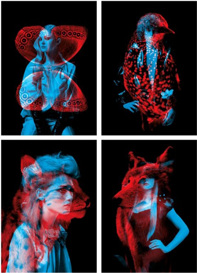
Dark with pops of color, kind of surreal.